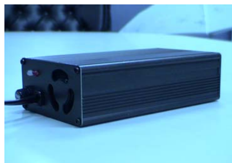
3A ~ 12A Charger