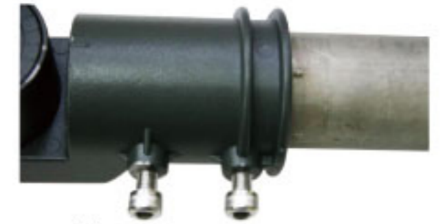
Hexagon screw 六角螺絲