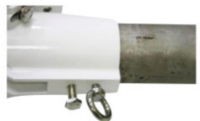
Hexagon screw 六角螺絲 Eye bolt 吊环螺栓锁